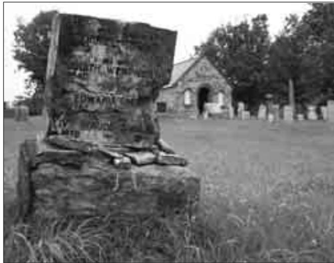
All that's left of Maplewood in the St. Francis River valley near Richmond, is a collection of crumbling headstones.

Unlike Quebec's Roman Catholic cemeteries, which are affiliated with individual churches, the Protestant cemeteries tended to be operated as multi-denominational burial grounds, welcoming Anglicans, Methodists, Baptists, Lutherans and other Protestant denominations from the surrounding area. In their day, they were run as private corporations, complete with boards of trustees made up of people in the community who were given the responsibility for ground maintenance, burial records, finances and ‘perpetual care’—a promise no longer viable in many communities.