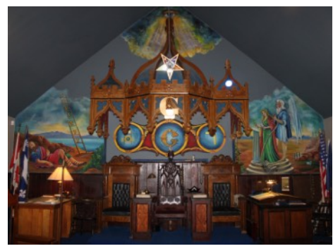
A peek inside Golden Rule Lodge No. 5, photo courtesy of Matthew Farfan.