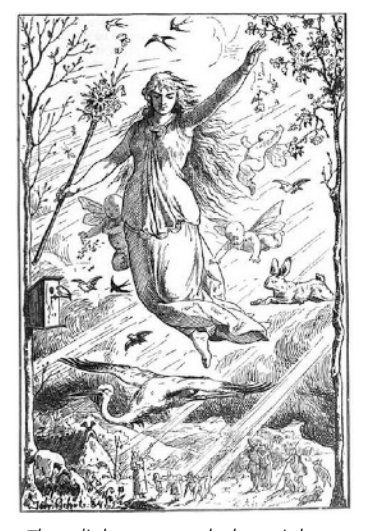
The witch, as a symbol can take on various forms and is ubiquitous throughout the folklore of numerous cultures. This image of Ostara (Johannes Gerhts, 1844) represents a Goddess of the Germanic people. She, like many subjects of legends and fairytales, has been re-interpreted throughout history.